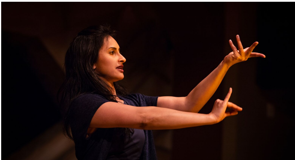
Crimson Cat Studios

Anu was a smart, funny kid with nothing to fear but a B on a report card. But when a wave of dark memories threatens to consume her, she must embrace a new identity in a daring dance for survival.